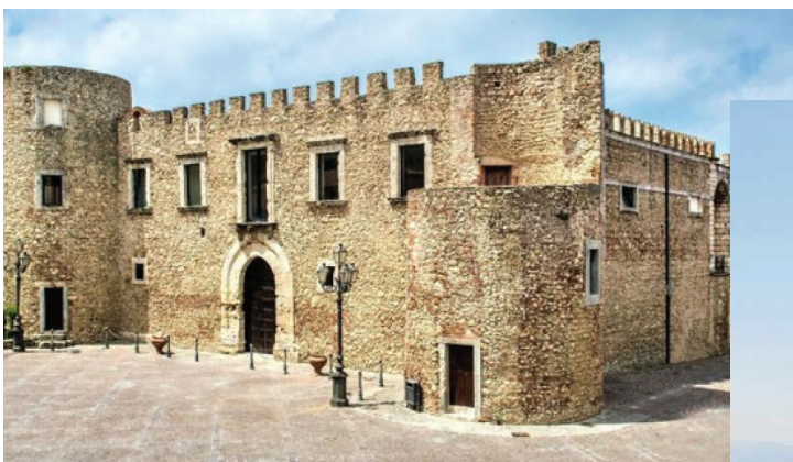
Roccavaldina e la sua Farmacia Storica