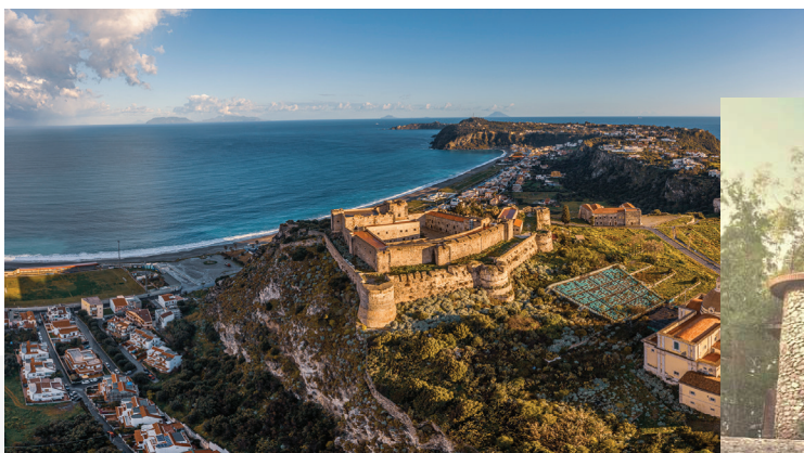
Milazzo & Castello di Milazzo