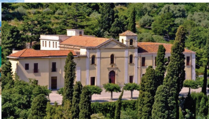
Santuario di Calvaruso