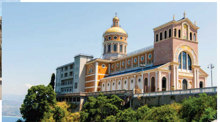
Santuario del Tindari