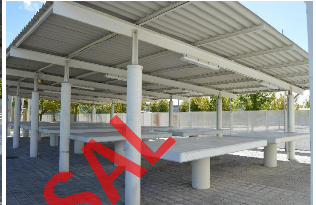
Boxes – 200 places