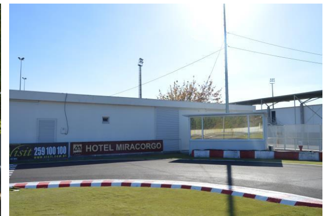
Timing and Arbitration room