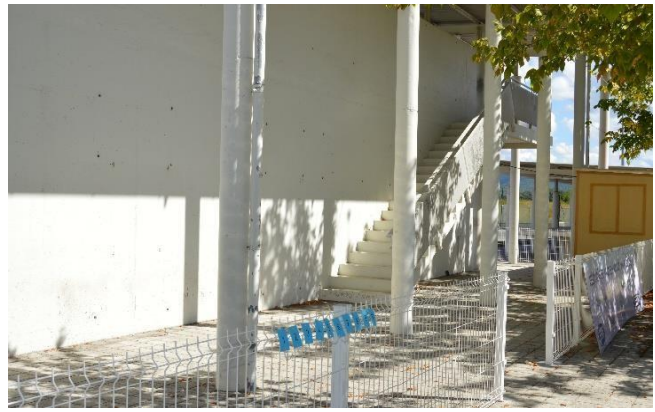
Driving stand stairs