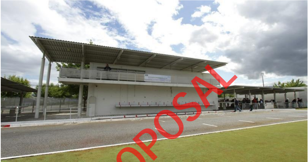
Drivers Stand and pits