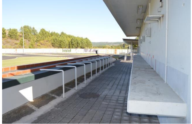
Refueling area / Pit lane