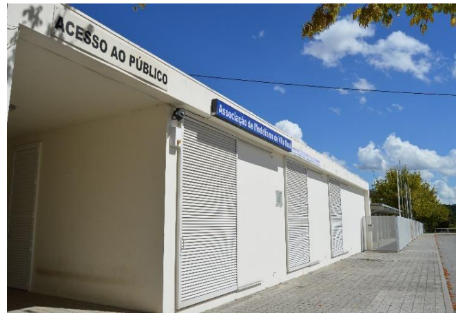
External support area

Application for the 2026 EFRA European Championship 1:8 GT