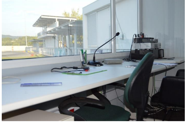
Timing and Arbitration room – inside view