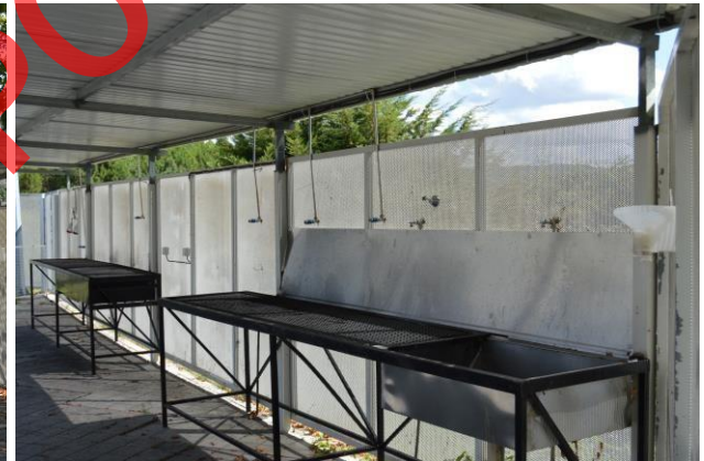
Setting table and / cleaning area